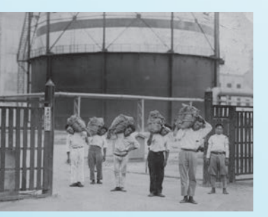
1934 First ammonium sulfate shipment

While industry peers considered Ube's low-grade coking coal unsuitable, from it UBE was able to synthesize ammonia, a key raw material for ammonium sulfate. Ube Nitrogen Industry, Ltd., contributed to the agricultural progress by commercializing that inorganic salt.